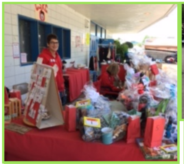
Our Club again held a raffle drawing on Saturday and Sunday thanks to the generosity of our members!!!